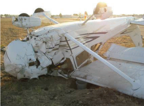
Aircraft sustained typically non-survivable impact. Airbag deployed and although the pilot sustained severe injury, he survived.

According to the National Highway Traffic Safety Administration, a total of 22,466 lives were saved by airbags in automobile crashes from 1987 to 2006. Their analysis indicates that when an airbag is used together with a seat belt, automotive fatalities are reduced by 11 percent.