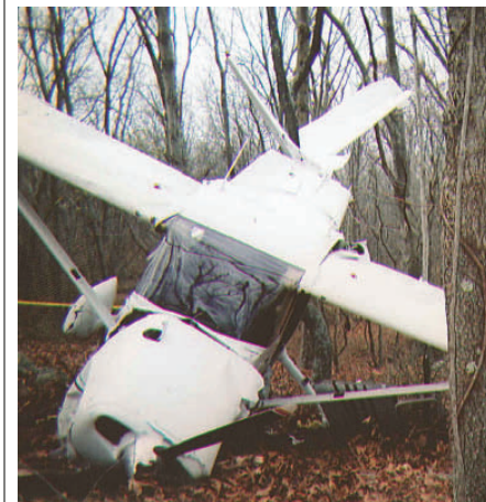
Airbags deployed and both occupants received only minor injuries.

Federal Aviation Administration Anchorage Aircraft Certification Office