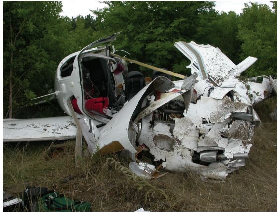
Aircraft stalled and cartwheeled. The aircraft was destroyed, but the airbags deployed and the occupants evacuated without life-threatening injuries.